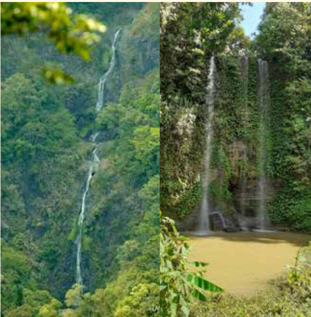
BINUKOT WATERFALLS Brgy. Lahug and Tacapan Tapaz, Capiz

Cascading and attractive waterfalls inside