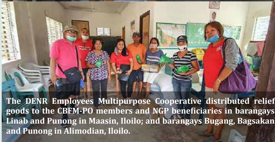
The DENR Employees Multipurpose Cooperative distributed relief goods to the CBFM-PO members and NGP beneficiaries in barangays Linab and Punong in Maasin, Iloilo; and barangays Bugang, Bagsakan and Punong in Alimodian, Iloilo.