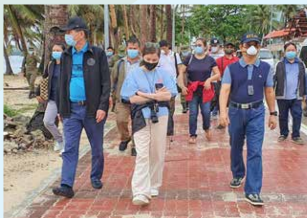
After the meeting, Secretary Cimatu led the BIATF to conduct an ocular inspection on the progress of the rehabilitation in the island.

With the resumption of tourism activities, both Secretary Año and Secretary Puyat said restrictions, such as curfew may still be imposed within the discretion of the LGU. Other restrictions such as denying entry to individuals