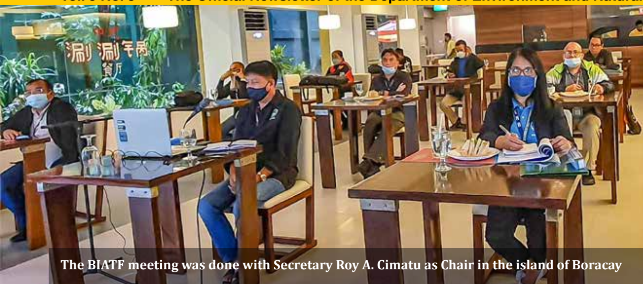
The BIATF meeting was done with Secretary Roy A. Cimatu as Chair in the island of Boracay