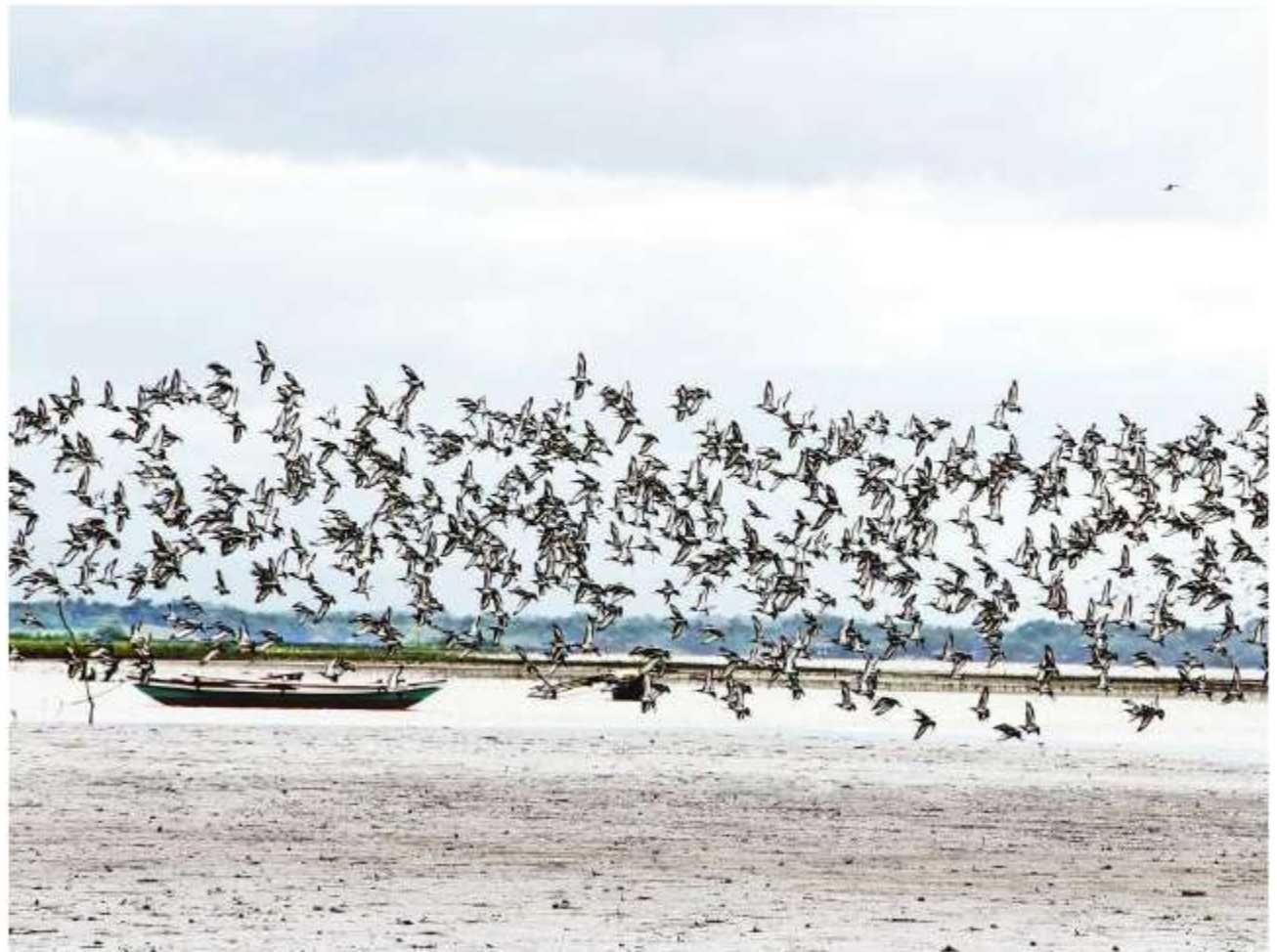
Thousands of migratory birds flocked to the NOCWCA each year.

One of the objectives of the Annual Waterbird Census is to monitor on an annual basis the status and condition of wetlands.