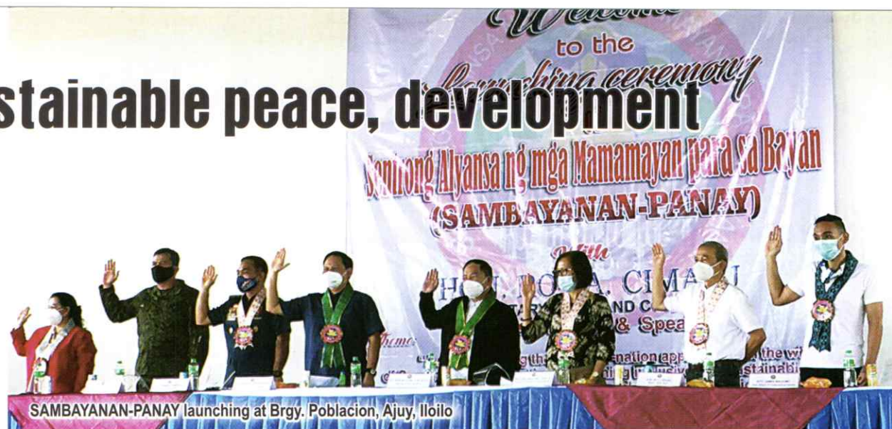
SAMBAYANAN-PANAY launching at Brgy. Poblacion, Ajuy, Iloilo