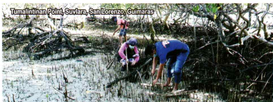
Tumalintinan Point, Suvlara, San Lorenzo, Guimaras