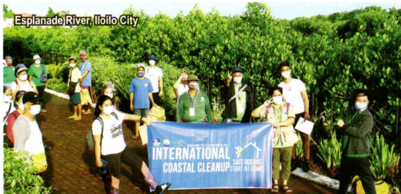
Esplanade River, Iloilo City

This year's event was celebrated with limited amount of volunteers observing physical distancing adhering safety protocols due to the rising cases of coronavirus disease (COVID-19).