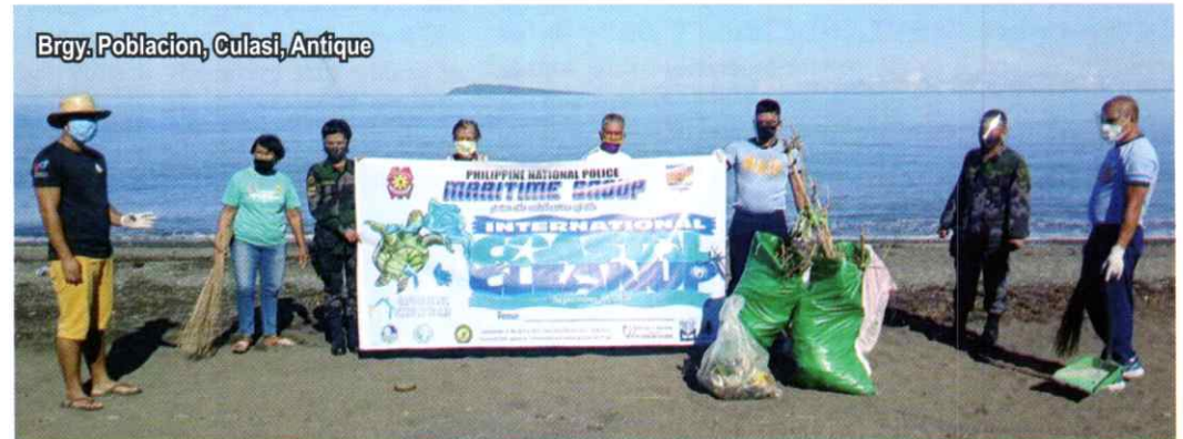
Brgy. Poblacion, Culasi, Antique