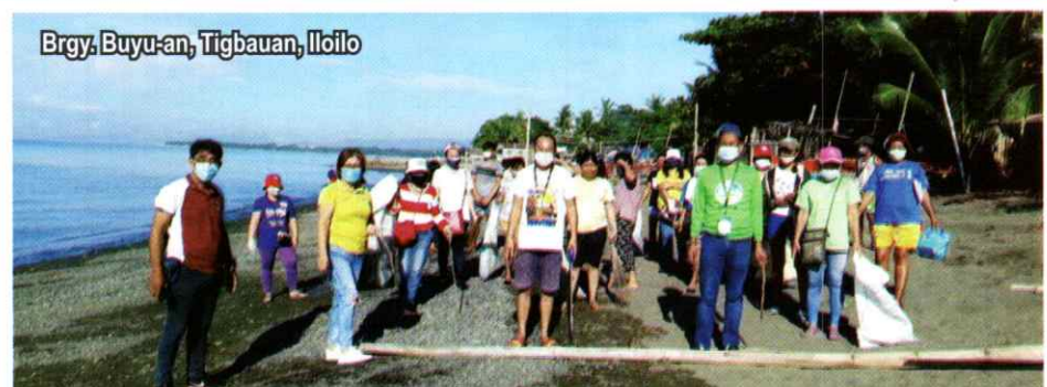
Brgy. Buyu-an, Tigbauan, Iloilo