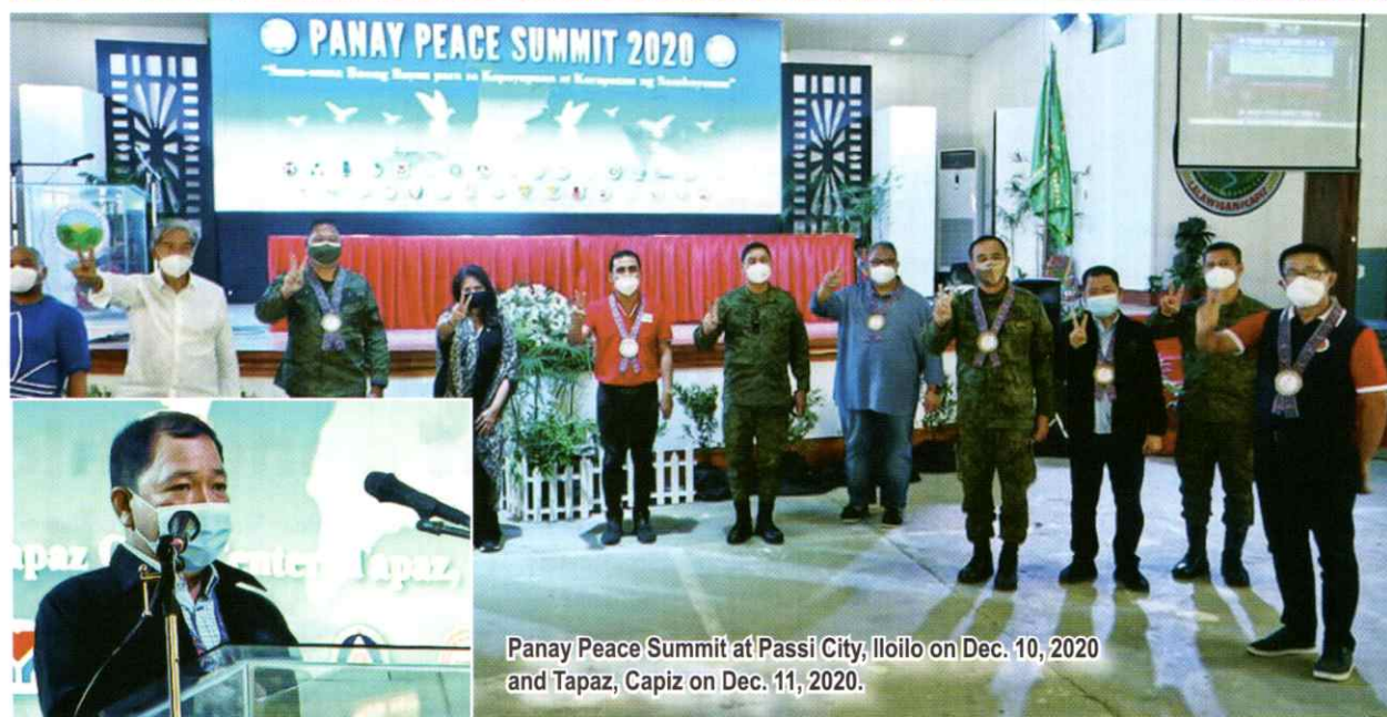
Panay Peace Summit at Passi City, Iloilo on Dec. 10, 2020 and Tapaz, Capiz on Dec. 11, 2020.

New People's Army (CPP-NPA) will only be achieved if people stop the breed of hate from their hearts which destroys the mind and soul of the community