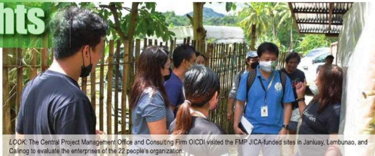
LOOK: The Central Project Management Office and Consulting Firm OICDI visited the FMP JICA-funded sites in Janiway, Lambunao, and Calinog to evaluate the enterprises of the 22 people's organization.

From September 11 to October 23, the organizations held the Save Our Watershed Exhibit in three Robinsons Malls (Pavia, Jaro, and Iloilo Main) with a collective data and visual representation of the province's water ecosystems, and student artworks and photographs.