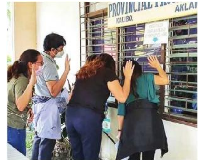
DENR 6 lawyers has sworn oath upon filing the cases against the violators before the Provincial Prosecutor's Office in Kalibo, Aklan.