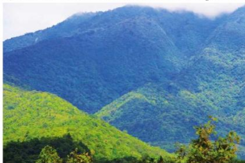
Northern Negros Natural Park (NNNP) in Negros Occidental

The Department installed public notice and signages in strategic locations across the protected area to warn potential buyers of public lands.###