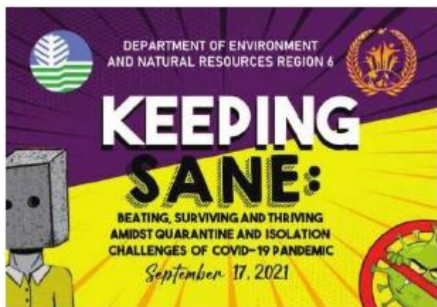
Keeping Sane Webinar

Aside from that, the Department are still looking for a way to further help those who are affected by the pandemic whether they are regular, casual and contract of service employees.###