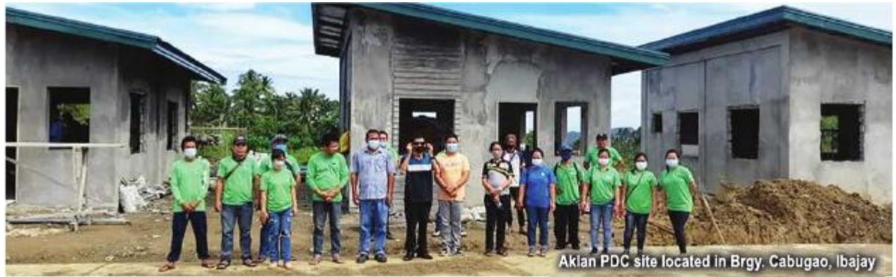
Aklan PDC site located in Brgy. Cabugao, Ibajay

All PDC sites that are now under construction and those that are yet to be established are milestones in the attainment of peace in this part