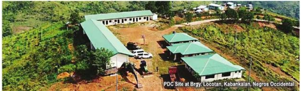
PDC Site at Brgy. Locotan, Kabankalan, Negros Occidental

of the country. It was done through the awarding of a tenurial instrument called Community-Based Forest Management Agreement or CBFMA. This is one of the components under the socio-economic reintegration under the peace negotiation of the government to the Kapatiran.