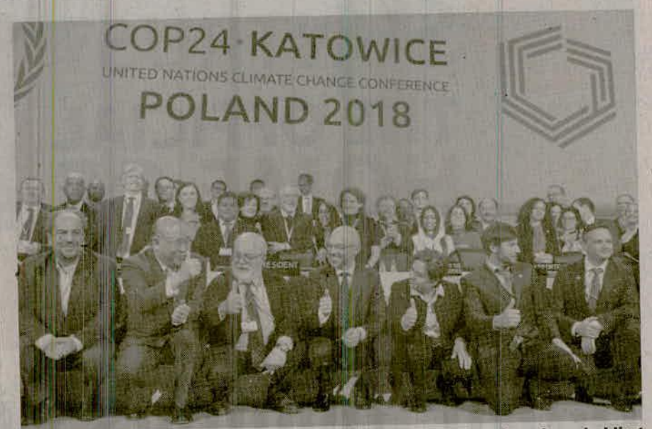
COMMON RULE BOOK – Representatives of nearly 200 nations have been holding talks at the UN's COP24 Summit in the Polish mining city of Katowice.

clarity from richer ones over how the future climate fight will be funded and pushed for so-called "loss and damage" measures.