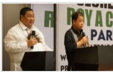
PROPOSED EPEB IS ALSO PROTECTIVE AND PROACTIVE