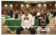
DENR TO PUSH FOR THE CREATION OF EPEB TO PROTECT FOREST RANGERS