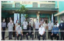
CSC 6 HONORS DENR 6 WITH PRIME-HRM BRONZE AWARD