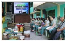
LECTURE ON HEALTH AND WELLNESS AND VEGETARIAN COOKING DEMONSTRATION