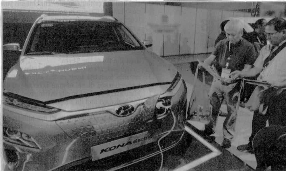
The Hyundai Kona Electric on display at the recent Philippine Electric Vehicle Summit.

The SPMJ Forum is held quarterly as a project of the organization composed of motoring journalists.